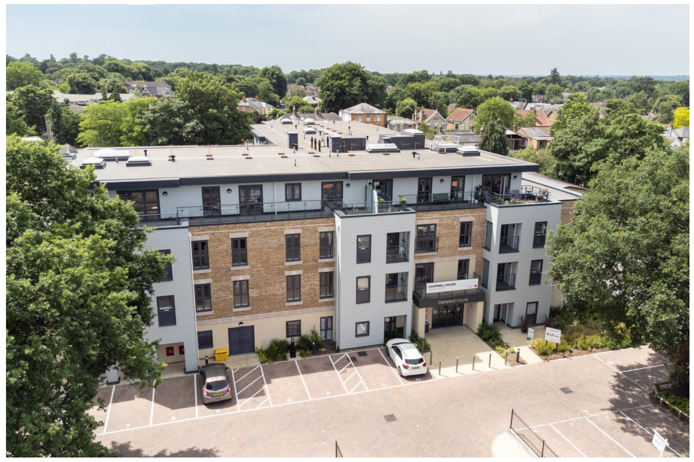
21 Campbell House Queens Road Weybridge Surrey KT13 9UX £650,000